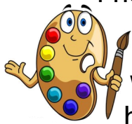
Photo of our work attached. A real mixed media session.